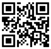
Purchase Yours Here!

READY, SET, MOVE FOR KIDS K-5TH GRADE!! From the hosts of the So & So Show, get your child's summer devotional here! This goes along with everything they will be learning this summer on Sundays, Camp Kidjam, & VBS!