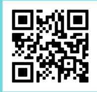
Purchase Yours Here!

READY, SET, MOVE FOR KIDS K-5TH GRADE!! From the hosts of the So & So Show, get your child's summer devotional here! This goes along with everything they will be learning this summer on Sundays, Camp Kidjam, & VBS!